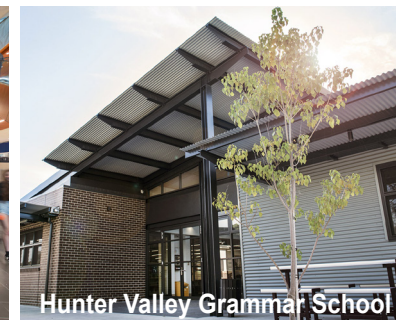
Hunter Valley Grammar School