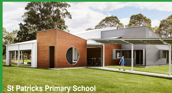
St Patricks Primary School

Date: Friday 2 August, 2019 Time: 10.00 am - 4.00 pm